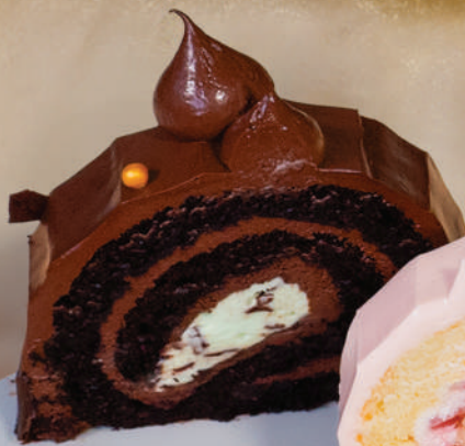
Peppermint Chocolate Flourless Log Cake