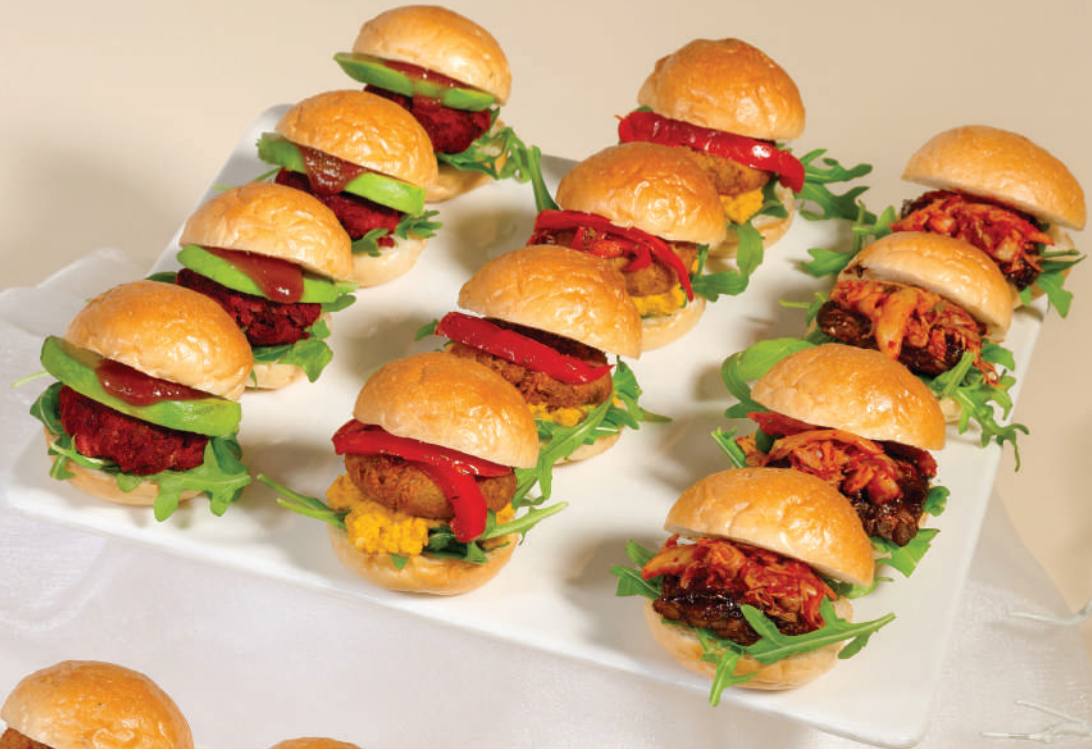
Falafel with Pumpkin Hummus