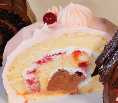
Strawberry Tiramisu Champagne Log Cake