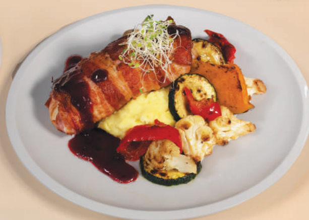
Turkey & Bacon Parcel