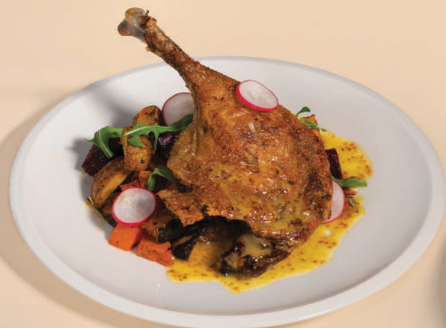
Duck Leg Confit

Join us to share the festive joy with your loved ones. Indulge in nourishing food & soul satisfying Christmas specials & beverages at all our outlets!