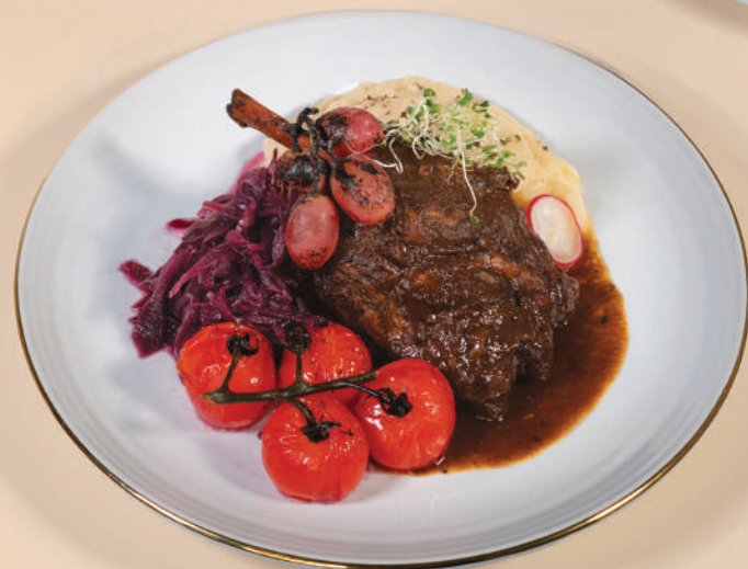
Grape Braised Duroc Pork

Visit our outlets at cedele.com/pages/locations