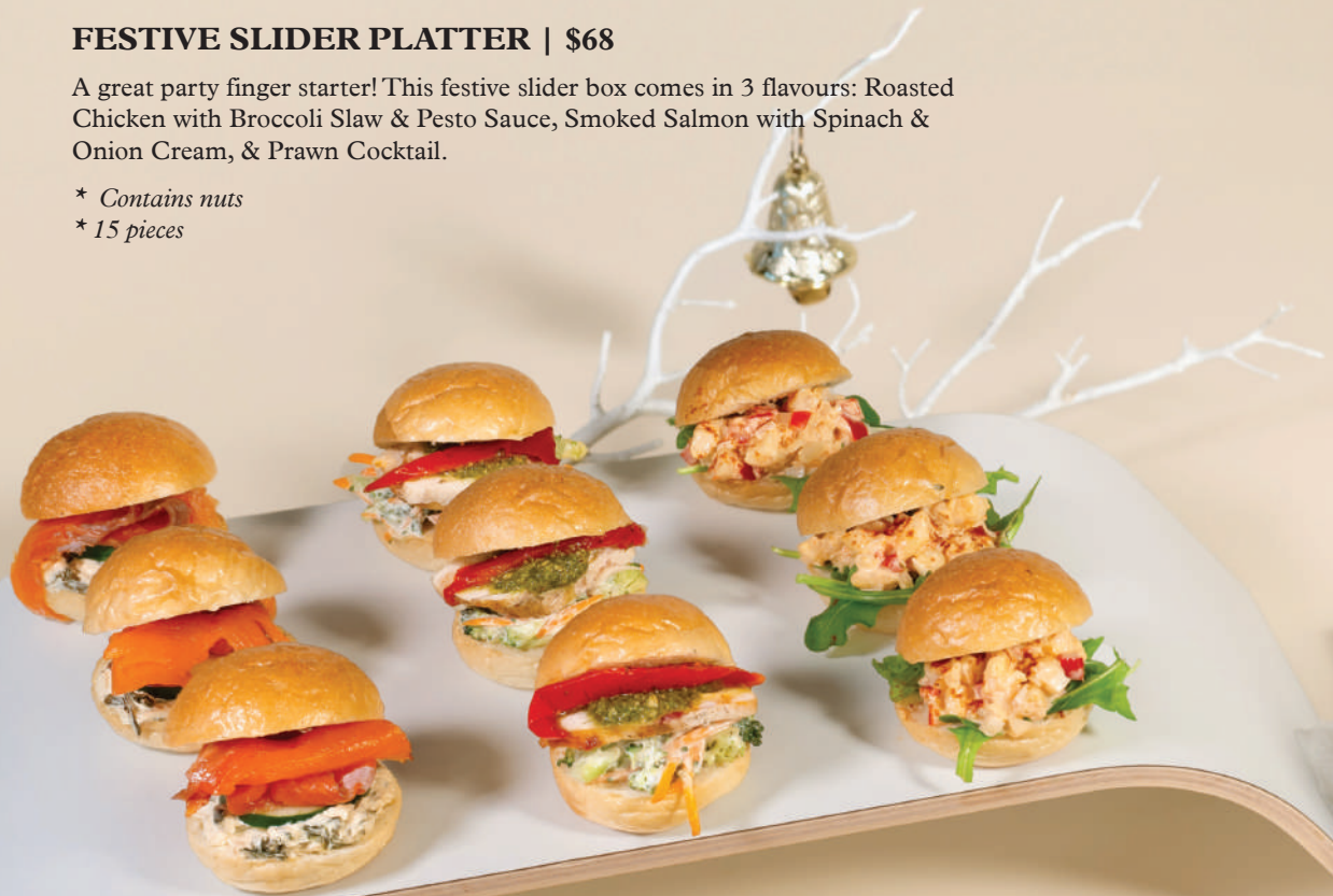
Smoked Salmon with Spinach & Onion Cream