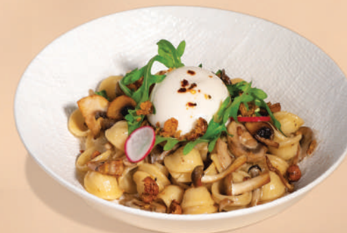
Plant-Based Mushroom Stroganoff Orecchiette