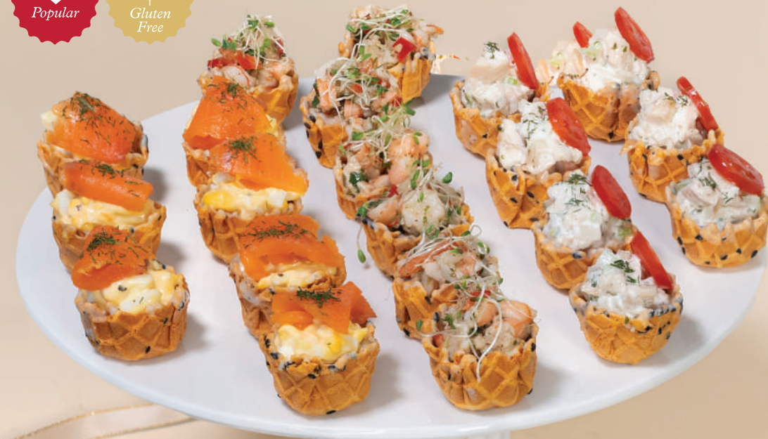
Smoked Salmon & Egg