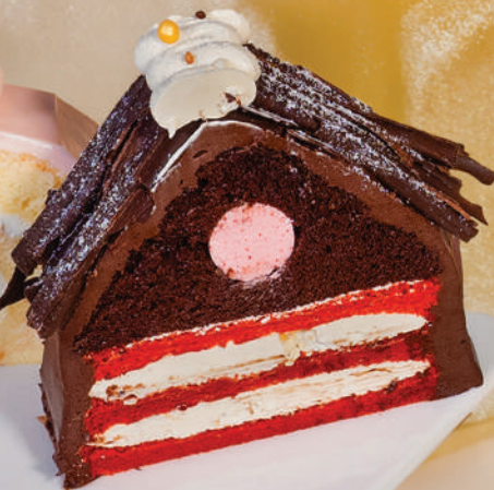
My Black Cabin Log House