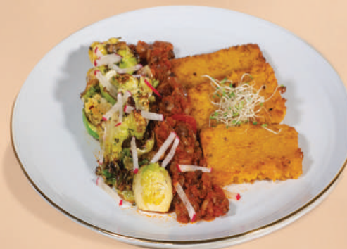
Plant-Based Crispy Pumpkin Polenta

GRAB YOUR VEGAN FRIENDS FOR AN UNFORGETTABLE GET-TOGETHER!