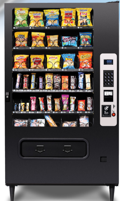
5W 40 Selections