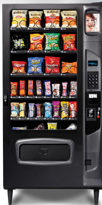
4W 32 Selections *Shown with Upgraded Styling