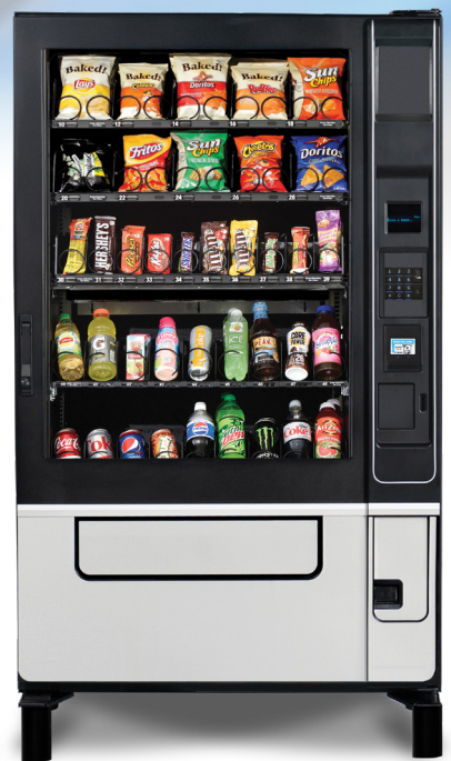
5-Wide Snack & Drink 38 Selections