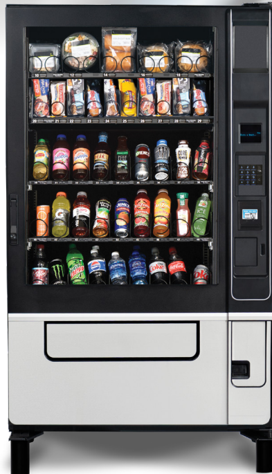
5-Wide Cold Food & Drink 42 Selections