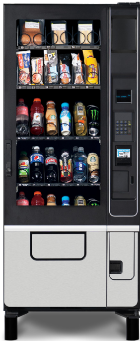
Cold Food & Drink 27 Selections