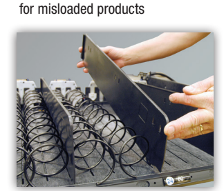
Re-configure trays to almost any package size in the field with no need for tools.