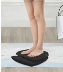
Exercised whole body