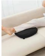
calf or thigh