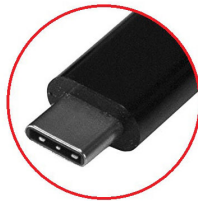
USB Connection Type Reference Chart