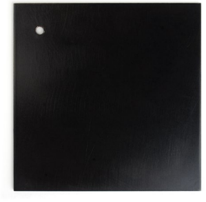
BLACKENED BRASS [3]