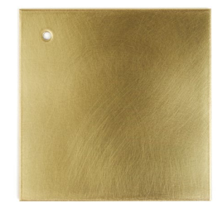
BRUSHED BRASS [2]