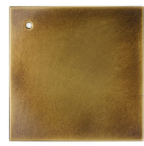
AGED BRASS [3]