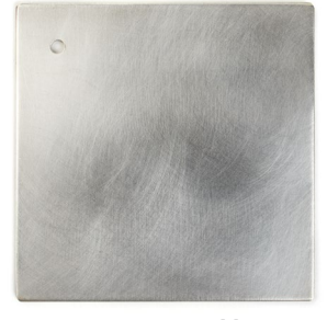
SATIN SILVER [2]