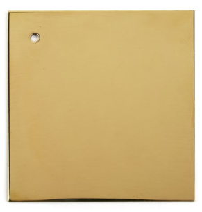
POLISHED BRASS [1]