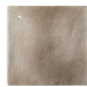
TARNISHED SILVER [3]

FINISH IS HAND SEALED WITH A TINY LAYER OF WAX, PROTECTING FROM PATINA OVER TIME, GIVING A SMOOTH TEXTURE TO THE SURFACES.