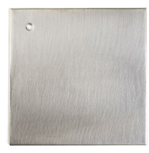
BRUSHED NICKEL [1]