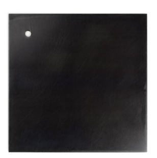
DARKENED BRASS [2]