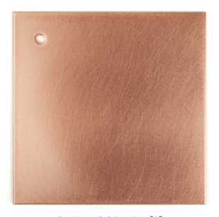
SATIN COPPER [2]