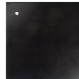
DARKENED BRASS [2]