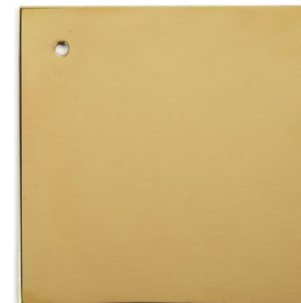
POLISHED BRASS [1]