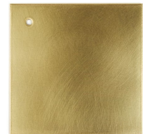
BRUSHED BRASS [2]