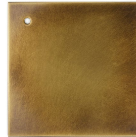
AGED BRASS [3]