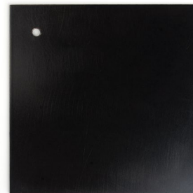
BLACKENED BRASS [3]