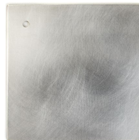
SATIN SILVER [2]