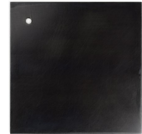
DARKENED BRASS [2]