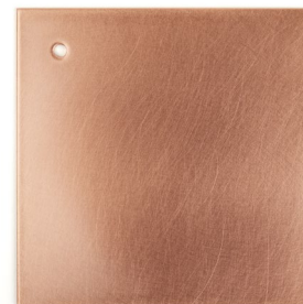
SATIN COPPER [2]