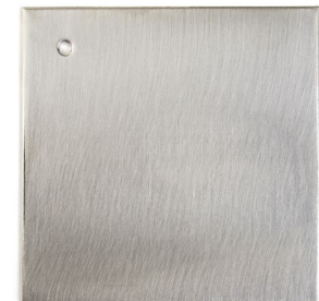
BRUSHED NICKEL [1]