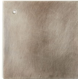
TARNISHED SILVER [3]

3 - WAXED: FINISH IS HAND SEALED WITH A TINY LAYER OF WAX, PROTECTING FROM PATINA OVER TIME, GIVING A SMOOTH TEXTURE TO THE SURFACES.