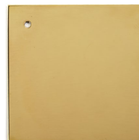
POLISHED BRASS [1]