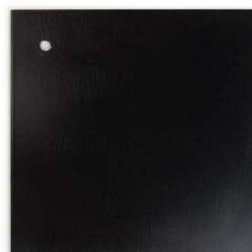
BLACKENED BRASS [3]