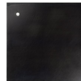
DARKENED BRASS [2]