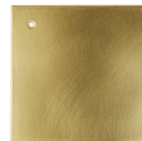
BRUSHED BRASS [2]