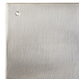
BRUSHED NICKEL [1]