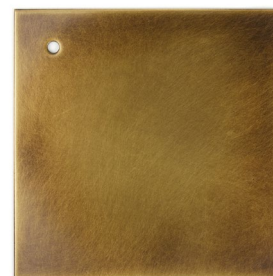
AGED BRASS [3]