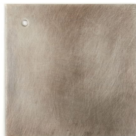
TARNISHED SILVER [3]

3 - WAXED: FINISH IS HAND SEALED WITH A TINY LAYER OF WAX, PROTECTING FROM PATINA OVER TIME, GIVING A SMOOTH TEXTURE TO THE SURFACES.