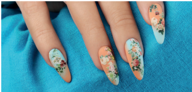
E.MiLac 469 Siesta Hour, E.MiLac 473 Fair Wind, Naildress 133 Tender Message