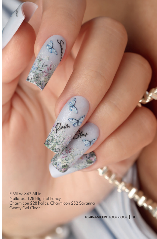
E.MiLac 347 All-in Naildress 128 Flight of Fancy Charmicon 228 Italics, Charmicon 252 Savanna Gemy Gel Clear

It's impossible to imagine the spring-summer season without flowers: that timeless print that will never go out of style and is unlikely to ever leave the women's wardrobe. Highly relevant in 2024 are 3D flowers.