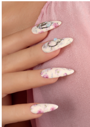
E.MiLac 364 Cotton, Foil glossy Silver Naildress 132 Waltz of the Flowers Multiple Design Gel, Rhinestones 03 White Opal