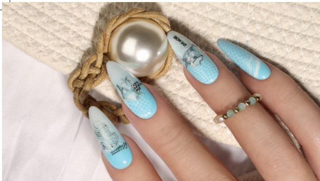
E.MiLac 001 White Lotus, E.MiLac 473 Fair Wind, Stamping Plate 17 Oceanica Nail Polish for Stamping 01 White, Naildress 129 Infinity, Charmicon 250 Reef Charmicon 252 Savanna, Charmicon 234 Summer Day