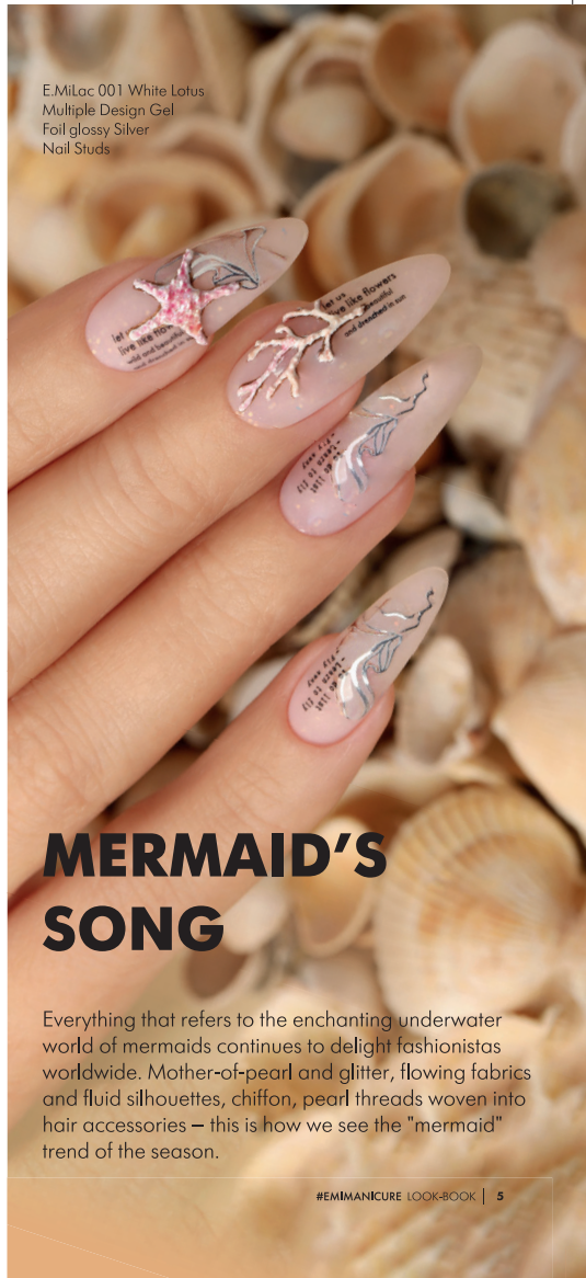
E.MiLac 001 White Lotus Multiple Design Gel Foil glossy Silver Nail Studs