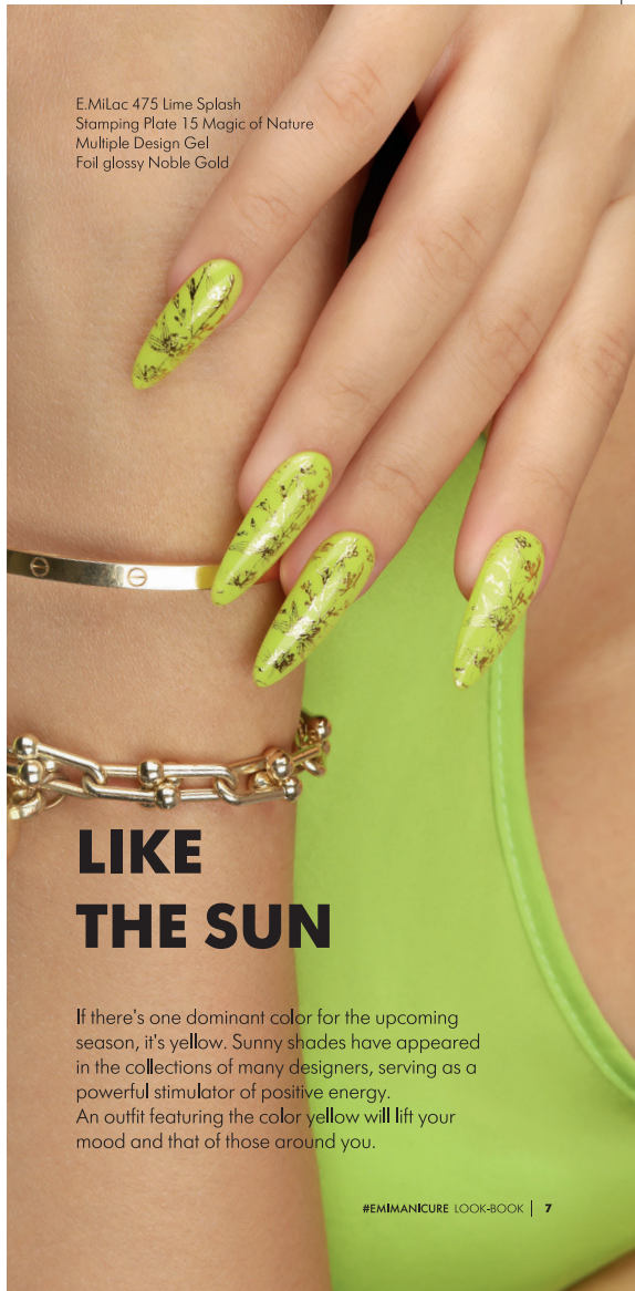
E.MiLac 475 Lime Splash Stamping Plate 15 Magic of Nature Multiple Design Gel Foil glossy Noble Gold