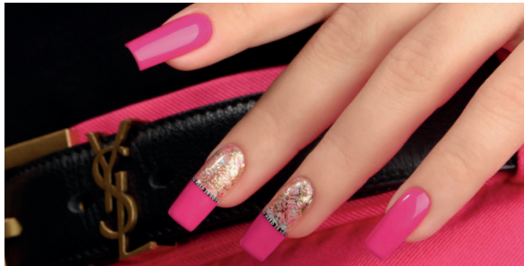
E.MiLac 381 Shy, E.MiLac 413 Breakfast at Tiffany's Charmicon 240 Beauty in Details, Foil glossy Noble Gold