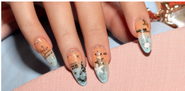
E.MiLac 469 Siesta Hour, E.MiLac 473 Fair Wind Charmicon 251 Maldives, Charmicon 252 Savanna