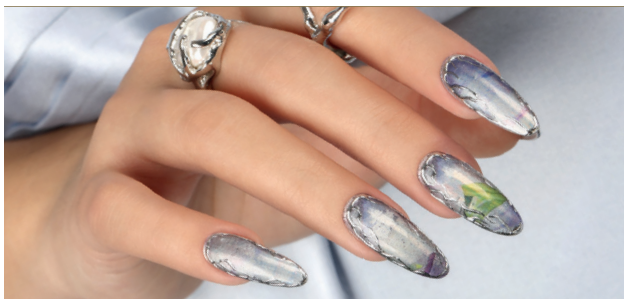
E.MiLac 372 Give Love, Charmicon 234 Summer Day, Naildress 129 Infinity Empasta Castanea, Gemy Gel Clear, Hilly Gel Paint 002 White Empasta Cranberry Red, Empasta Yellow Corn