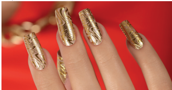
E.MiLac 442 Sunkissed, Stamping Plate 13 Textures Multiple Design Gel, Foil glossy Gold