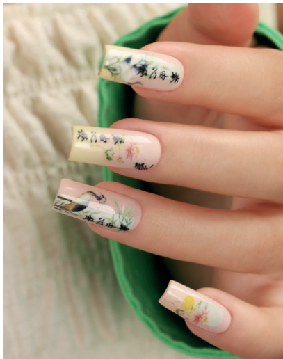
E.MiLac 152 Sparkly Beige E.MiLac 414 Comomile Field Naildress 124 East

E.MiLac 001 White Lotus Hilly Gel Paint 002 White Multiple Design Gel Foil glossy Noble Gold