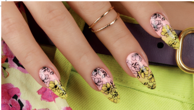
E.MiLac 468 Pink Horizon, E.MiLac 470 Feather Grass, Nail Polish for Stamping 02 Black and 05 Yellow, Nail Polish for Stamping 07 Pink, Stamping plate 15 Magic of Nature