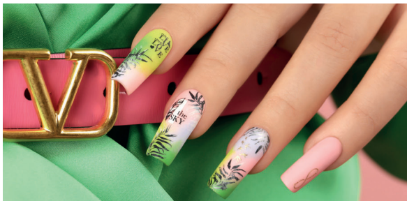
E.MiLac 468 Pink Horizon / 472 August Heat / 474 Siren Song / 475 Lime Splash Stamping Plate 15 Magic of Nature