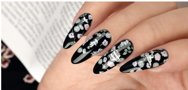
E.MiLac 030 Black Gloss, Naildress 128 Flight of Fancy, Charmicon 234 Summer Day