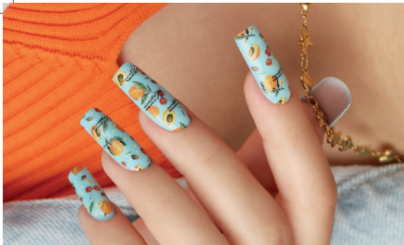
E.MiLac 473 Fair Wind, Naildress 134 Vitamin Boost, Charmicon 252 Savanna