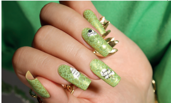
E.MiLac 475 Lime Splash, Pigment Mermaid Tail 204, Stamping Plate 17 Oceanica Nail Polish for Stamping 09 Light Green, Charmicon 252 Savanna / 249 Grace Gemy Gel Clear

Metallic is no longer just a trend; it's a fashion constant. Sparkle is everywhere: rhinestones, sequins, metallic decor, shiny fabrics. Gold, silver, gemstones... You can have it all at once.