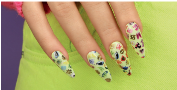
E.MiLac 414 Camomile Field, Naildress 130 Bright Life, Gemty Gel Clear