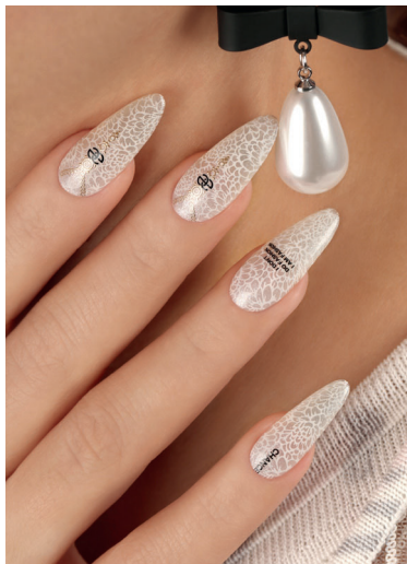
E.MiLac 389 Swish of Silk Stamping Plate 12 Flower Garden Nail Polish for Stamping 01 White, Charmicon 235 Chance