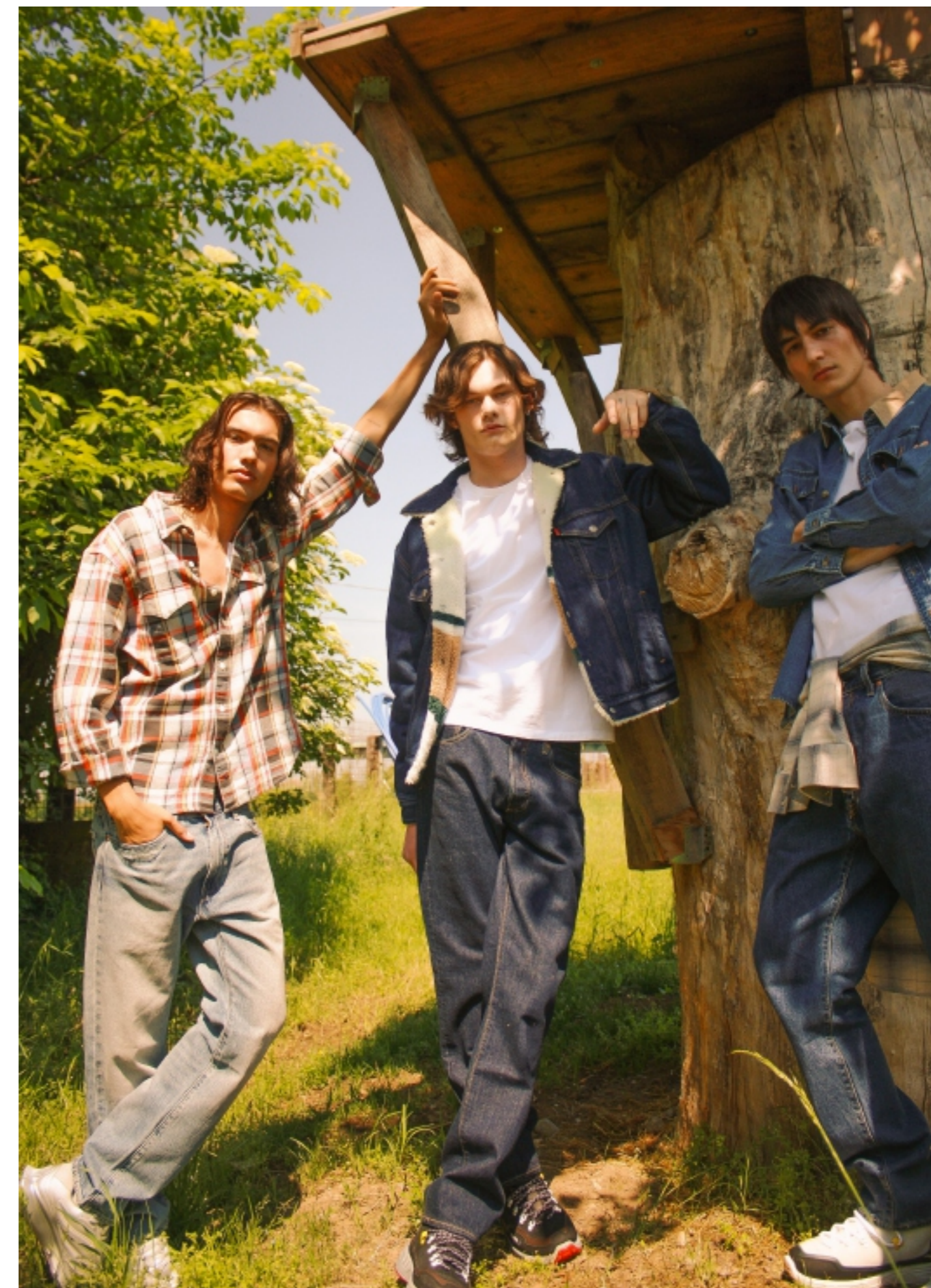
Shoes Pantofola D'oro Shoes Pantofola D'oro