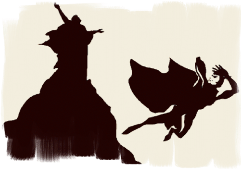
Jesus defeats Satan.

But Jesus doesn't just do great wonders to amaze us. Jesus does His wonders to show that He is a kind and merciful King Who rules over all our enemies for us.