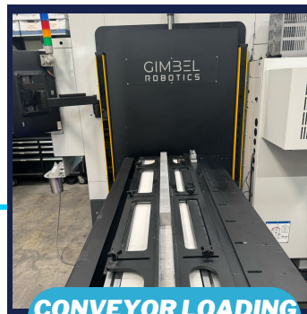
CONVEYOR LOADING SYSTEM