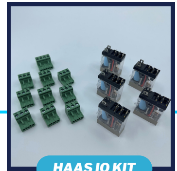
HAAS IO KIT