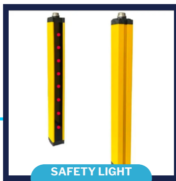
SAFETY LIGHT CURTAINS