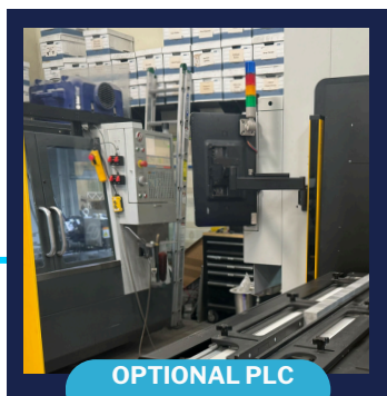
OPTIONAL PLC INTEGRATION