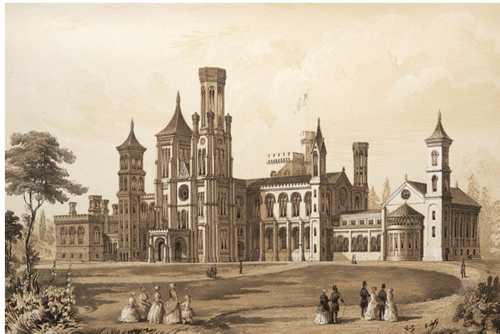
This is a drawing of the Smithsonian Institute as it looked in 1849.

Biologists collect plants and animals and describe them thoroughly. They compare different species and varieties of animals so they can tell one from another. They place type in a “type collection,” like the one at the Smithsonian Institute in Washington, D.C. It contains the largest plant, animal, mineral and human skeleton collection in the