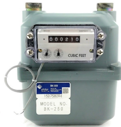
BK250 with PulseMaster-1P