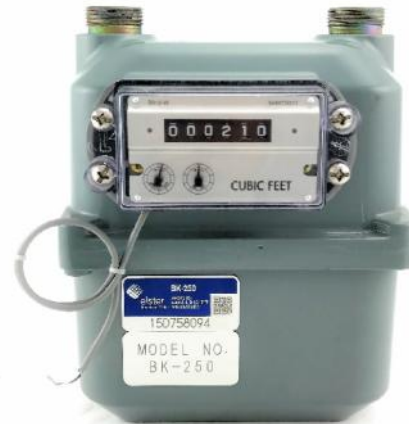
BK250 with PulseMaster-1P