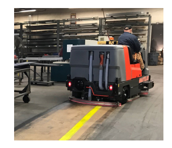
Clean and Safe Floors in a Single Pass