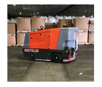
High Performance Industrial Cleaning Results