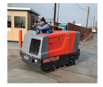
Versatile Outdoor Cleaning Applications