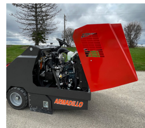
Maintenance Benefits Full engine access for easy serviceability