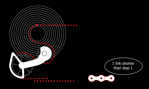
STEP 2: When tension is applied on the chain and the OSPW System appears to be aligned as the diagram above, cut the chain 1 full link (inner + outer link combination) shorter to ensure adequate chain tension is present in all gears (small chain ring/smallest cog allowed on the cassette).