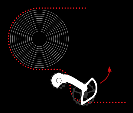
STEP 3: With the chain now cut to length it is important to test the clearance of the OSPW Aero System when the rear derailleur is set in the largest cog on the cassette. Just as the arrow indicates the cage should be able to rotate counter clockwise. It is important that there is some clearance between the upper pulley wheel of the OSPW Aero System and the largest cog on the cassette. If you find the clearance is not enough, adjust the B-tension accordingly.