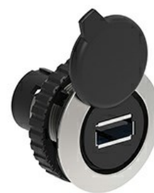
USB interface, A/A female type connection LPFD0