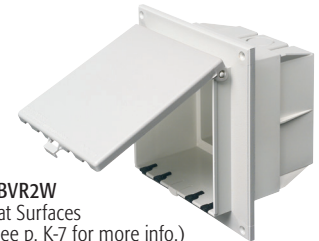
DBVR2W Flat Surfaces (See p. K-7 for more info.)