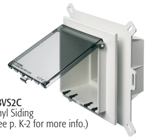
DBVS2C Vinyl Siding (See p. K-2 for more info.)