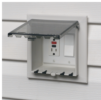
Completed installation, DBVS2C shown.

Box with extra duty weatherproof in use cover; installed bug plugs; (1) decorator wall plate; and (2) NM cable connectors. DBVM2 also includes a block bushing with washer; and an in place, disposable mud cover. DBVR2 also includes (1) set installation screws; and (1) roll of caulk. DBVS2 also includes (1) set installation screws.