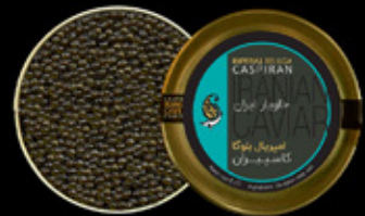
Caspiran Sea Imperial Beluga Caviar (30g) RM688