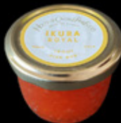
Trout Roe (80g) RM120