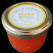
Salmon Roe (80g) RM148