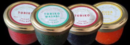
Lumfish Roe (Red, Wasabi, Black, Orange) RM78