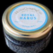
Avruga Herring Roe (80g) RM98