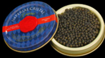
Imperial Cristal Osetra Caviar (10g/30g) RM138/RM368