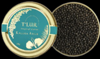
T'lur Amor Kaluga Caviar (30g) RM360

Traditionally, the term caviar refers only to roe from wild sturgeon in the Caspian Sea and Black Sea (Beluga, Osetra and Sevruga caviars) with a recorded history of over 1000 years reaching the tables of aristocratic and noble Greeks in the 10th century. As well as Iranian Beluga we are happy to serve Malaysia's very own T'lur caviar, grown in Tanjong Malim as well as Imperial Crystal from Qingdao China which now accounts for 85% of the world's production.