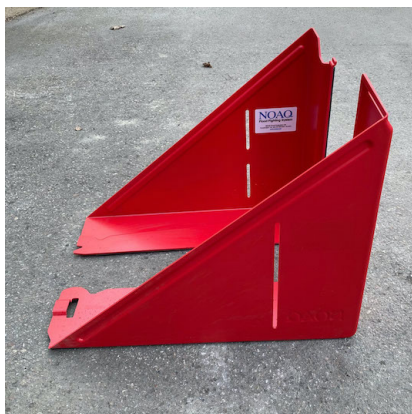
Left hand and right hand gables