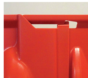
3° in the other direction