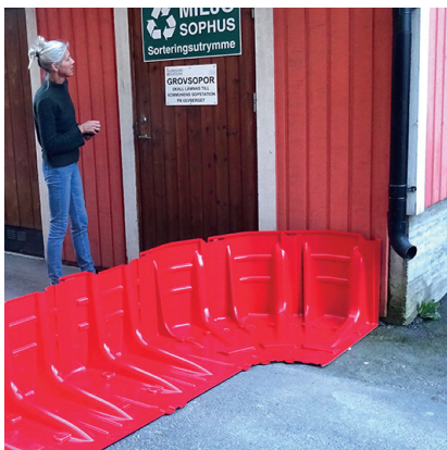
Connection using corner boxes..