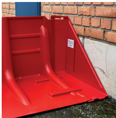
Connection using a gable..