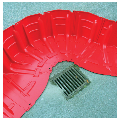
Drag the boxwall behind gullies