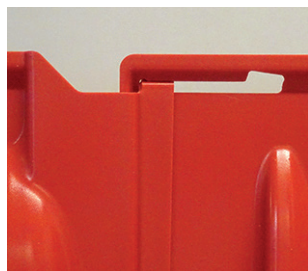
3° in one direction