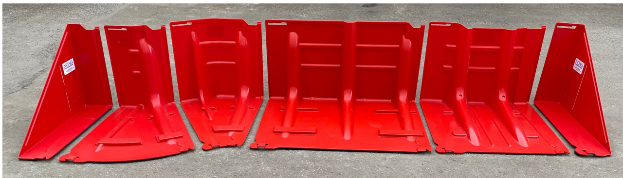
BW52-GR, BW50-OC, BW50-IC, BW52, BW50, BW52-GL