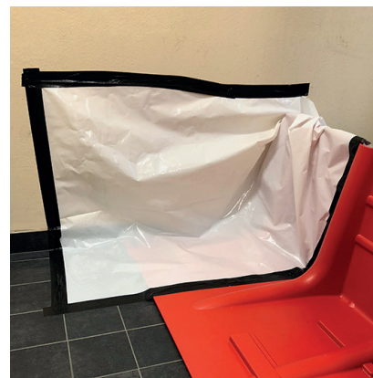
Using a piece of liner for sealing