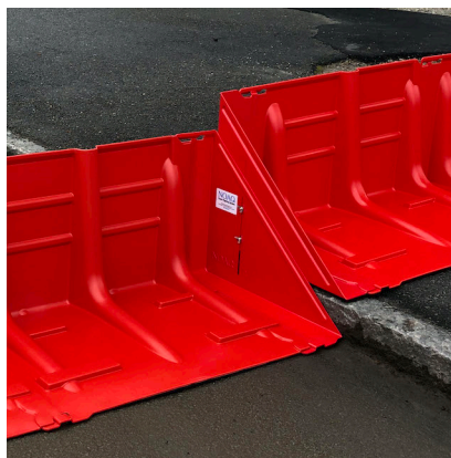
Gables to cope with kerb stones