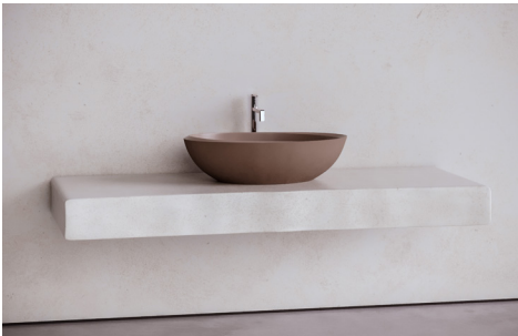
BROWN ELEVATED CONCRETE BROWN INTERIOR EC-S2-BROWN