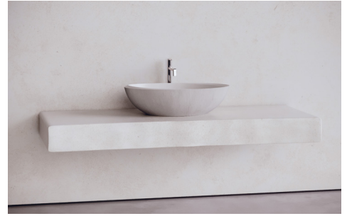
BONE ELEVATED CONCRETE BONE INTERIOR EC-S2-BONE