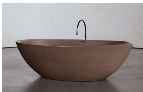
BROWN ELEVATED CONCRETE BROWN INTERIOR EC-B3-BROWN