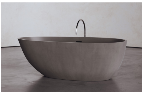
GRAY ELEVATED CONCRETE GRAY INTERIOR EC-B3-GRAY