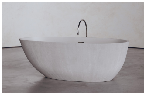
BONE ELEVATED CONCRETE BONE INTERIOR EC-B3-BONE