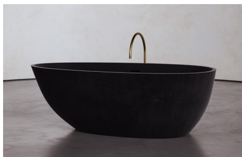
BLACK ELEVATED CONCRETE BLACK INTERIOR EC-B3-BLACK