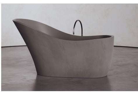
GRAY ELEVATED CONCRETE GRAY INTERIOR EC-B2-GRAY