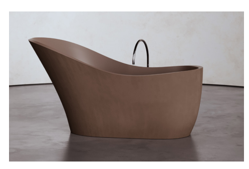
BROWN ELEVATED CONCRETE BROWN INTERIOR EC-B2-BROWN