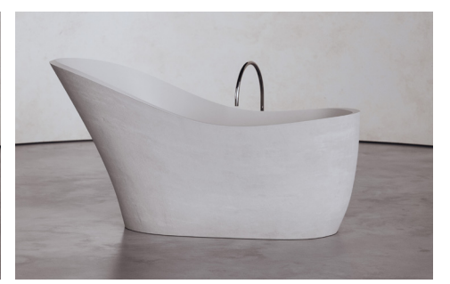
BONE ELEVATED CONCRETE BONE INTERIOR EC-B2-BONE