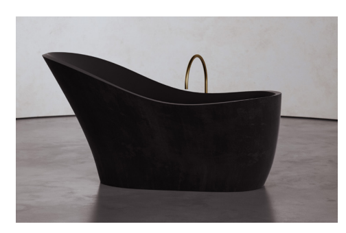
BLACK ELEVATED CONCRETE BLACK INTERIOR EC-B2-BLACK