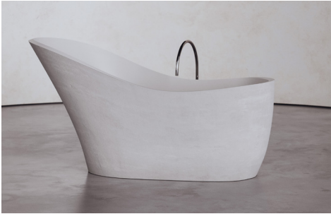
BONE ELEVATED CONCRETE BONE INTERIOR EC-B2-BONE