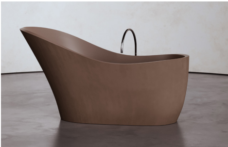
BROWN ELEVATED CONCRETE BROWN INTERIOR EC-B2-BROWN