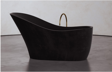
BLACK ELEVATED CONCRETE BLACK INTERIOR EC-B2-BLACK