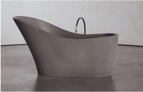
GRAY ELEVATED CONCRETE GRAY INTERIOR EC-B2-GRAY