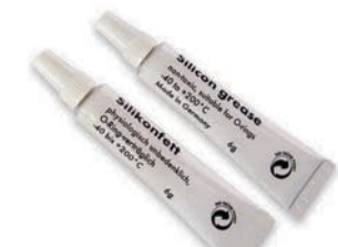
silicon grease tube 6g 030-6

For more information, please visit www.royalexclusiv.com . Simply enter the part number or name into the search box or email: info@royalexclusiv.com .