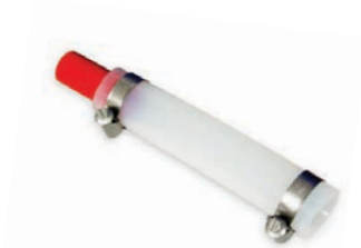
silicon anti-vibration 119-25