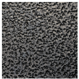
Black Texture (BT)