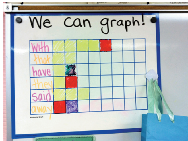
The Sight Word Graph as done in the classroom next door to mine.

I originally saw this activity done in the classroom next door to mine, (as in the picture shown below) and was given permission to share it with you here! This activity was designed to be done in a whole group setting, but would probably also work in a small group as well with some modifications. My class does this as a part of our morning calendar routine. Each day, our helper of the day chooses one sight word flash card out of the bag and reads it. Then he or she finds that word on the graph and colors in one space for that word. Then the class sings that sight word song from HeidiSongs Sing and Spell the Sight Word CD's! (See http://www.heidisongs.com ). To finish up the activity, ask the children which word has the most and the least amount of boxes filled in on the graph, and if any of them are equal. A blank master is also provided so that you can change the words to suit your own students' needs. I chose to use the words that my school district requires that seem to be the hardest ones for my students this year.