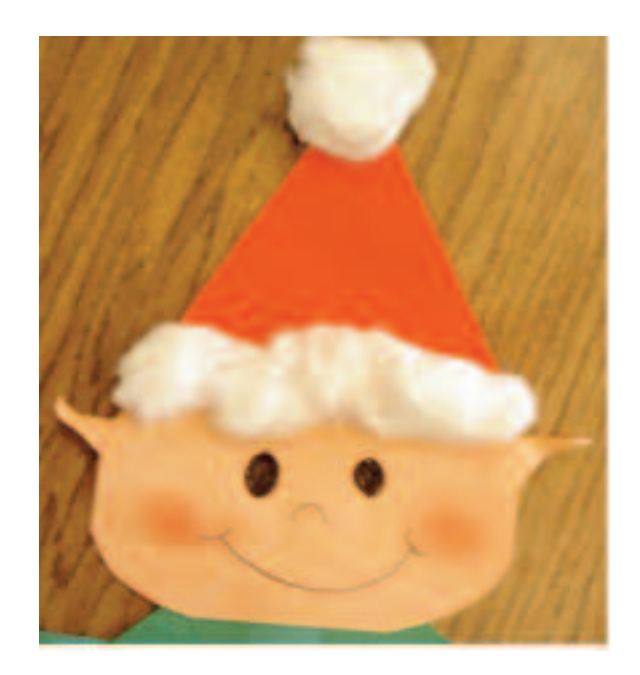
Rosy cheeks are made by rubbing a piece of red chalk with a cotton ball, and then applying it to the face like blush.