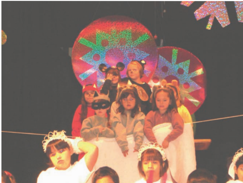
The characters behind the felt mitten on stage.