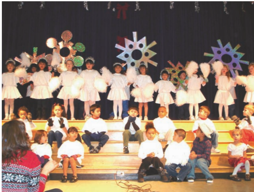
Snowflake Group Picture on Stage