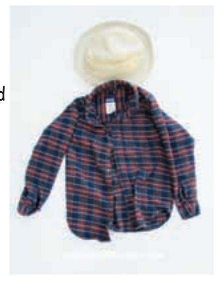
The Old Man

Use a colorful dress and add a white pinafore. Powder the hair gray and add an old lady's hat and glasses. Add wrinkles with make-up.