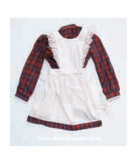
The Old Woman