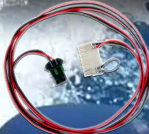
ASNU 185E2 Injector Harness for E-TEC 2-Pin