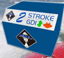
ASNU 2SGDI Driver Box