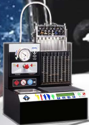
ASNU Classic GDI/ GDI Box

In addition to the supplied contents, you will also require: