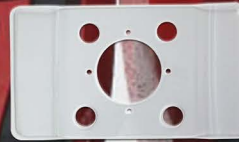
ASNU 185T Cleaning Tray