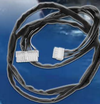
ASNU 125 Adapter box to ASNU connection cable