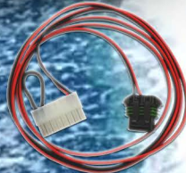
ASNU 185E3 Injector Harness for E-TEC 3-Pin