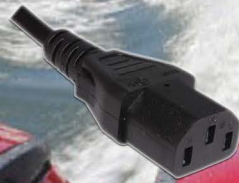
ASNU 147 Mains power lead