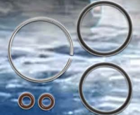
ASNU 185SK E-TEC Seal Kit

In addition to the supplied contents, you will also require: