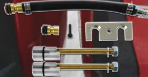
ASNU 185ETEC Injector Fuel Connection & Blanking plug for E-TEC