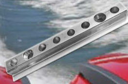
ASNU 185D Ficht & E-TEC Mounting Frame