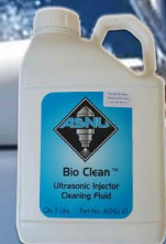
ASNU 41 Bioclean