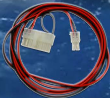
ASNU 185F Injector Harness for Ficht