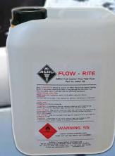
ASNU 42 Flowrite