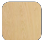
Hardrock Maple (HM)◆

Featuring ten laminate colors with coordinating edge band options. High-pressure laminate and custom colors available.