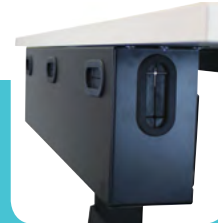
Wire Management Box XWMB