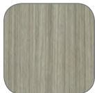
Concrete Groovz (CG)**