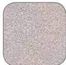
Gray Matrix (GM)◆***