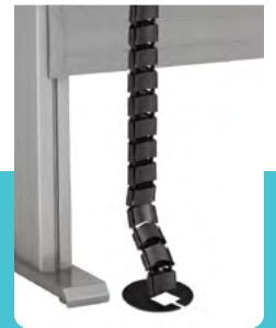
Flex Wire Management FCM490