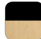
Black Base (B) Hardrock Maple Top (HM)