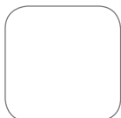
Galaxy White (GW)◆

◆Includes 4EVERedge™ edge banding for straight line worksurfaces **Driftwood, Concrete Groovz, and, Merapi have Graphite edge banding ***Gray Matrix has Black edge banding