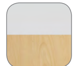
Silver Base (S) Hardrock Maple Top (HM)