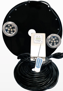
Small Olympus Lighting Accents fits: .5 & 1Hp Floating Fountains