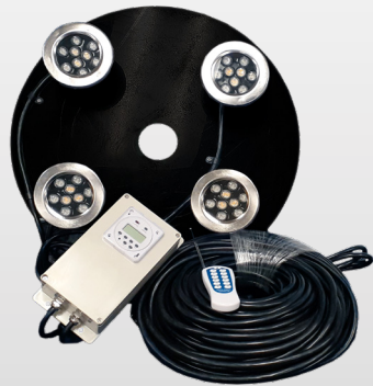
XL Olympus Lighting Accents fits: 3Hp Floating Fountains