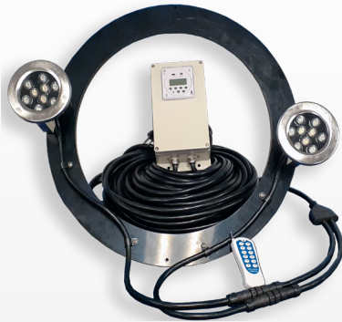
Power House Lighting Accents fits: Aerating Fountains & Dual Propeller Surface Aerators