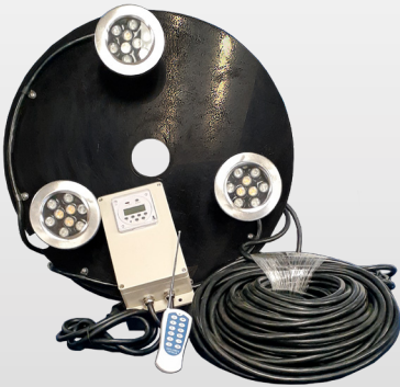
Large Olympus Lighting Accents fits: 1.5Hp Floating Fountains