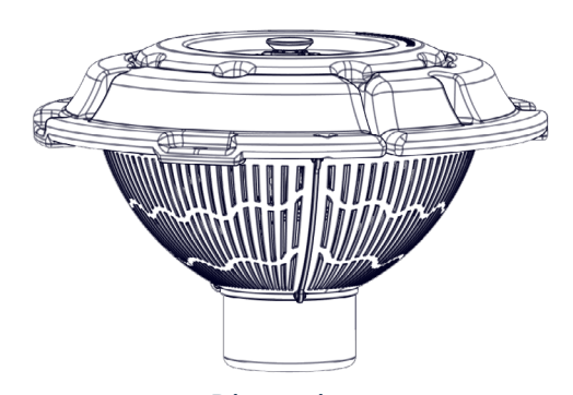
Dimensions Float width w/ brackets: 28" Unit height with float: 18"