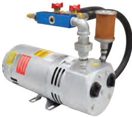
PA50 • Fig. 4c