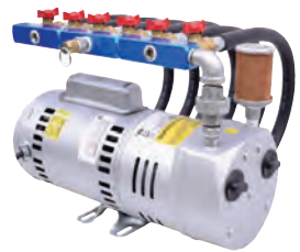
PA100 • Fig. 4c