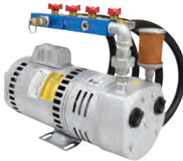
PA75 • Fig. 4c