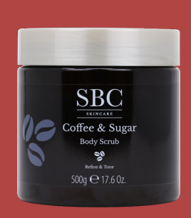
Coffee & Sugar Scrub