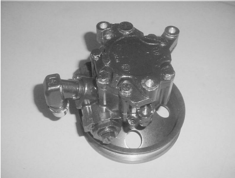
TYPE 2 (ZF)