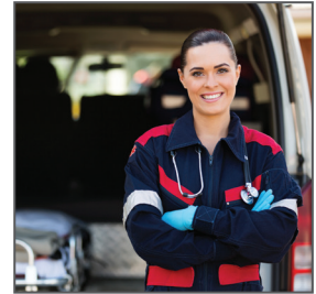
Emergency Medical Service