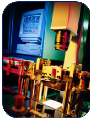
Blade Tooth Inspection