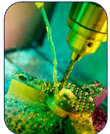
Grinder Plate Drilling