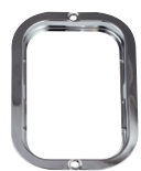
Part No. 59401C Chrome Bkt