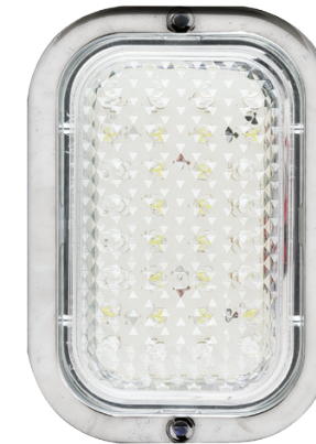
Reverse 130WMC - Single Blister