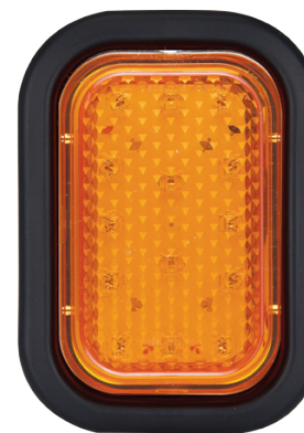
Rear Indicator 130AMG - Single Blister 130AMB - Light Only Bulk