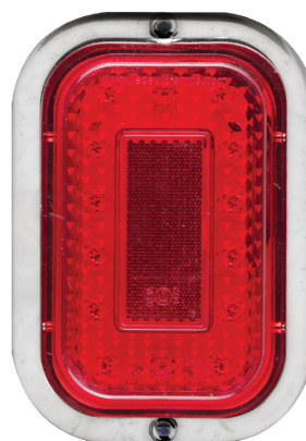
Stop/Tail 130RMC - Single Blister