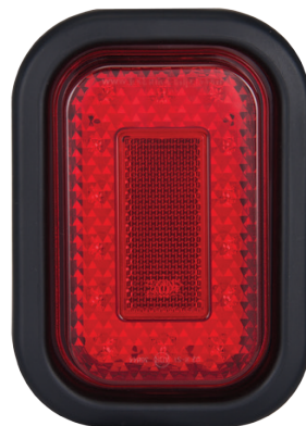
Stop/Tail 130RMG - Single Blister 130RMB - Light Only Bulk