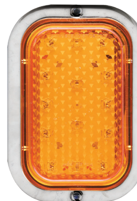
Rear Indicator 130AMC - Single Blister