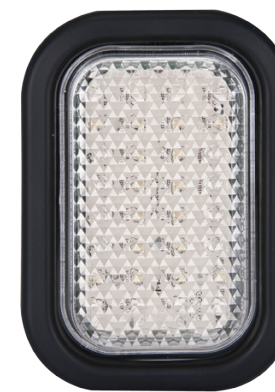
Reverse 130WMB - Single Blister 130WMB - Light Only Bulk