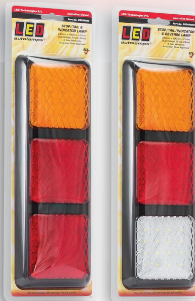
Part Number 282ARRM