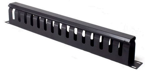
1RU HORIZONTAL 24 SLOTS CABLE MANAGEMENT RAIL